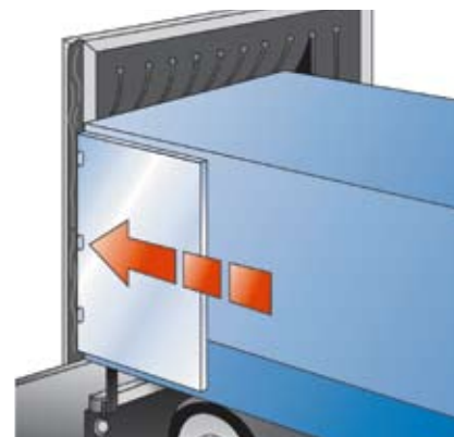
Highly flexible construction.