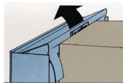
Self-adjusting roof frame.