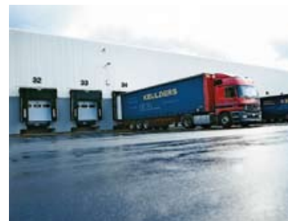
For a wide range of vehicle sizes.