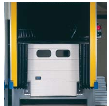
For high and low lorries.